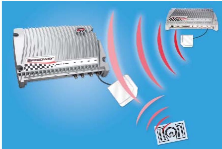
Figure 3 Reader-to-Reader Interference

enough to overpower the signal coming from the tag of interest, the local reader may not be able to discern the tag response (see Figure 3).